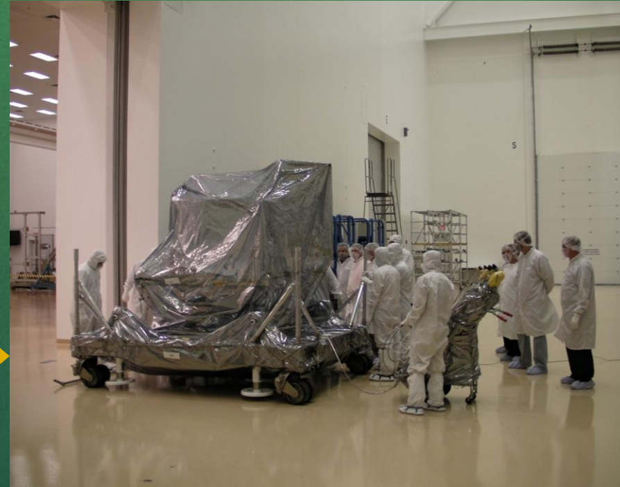
OLI arrival to Orbital

Need to maintain December 2012 LRD at all costs because launch window is December 1-30, 2012; Atlas V manifest is very crowded in 2013 – the only open slot is October 2013 at VAFB. This is a 10 month delay.